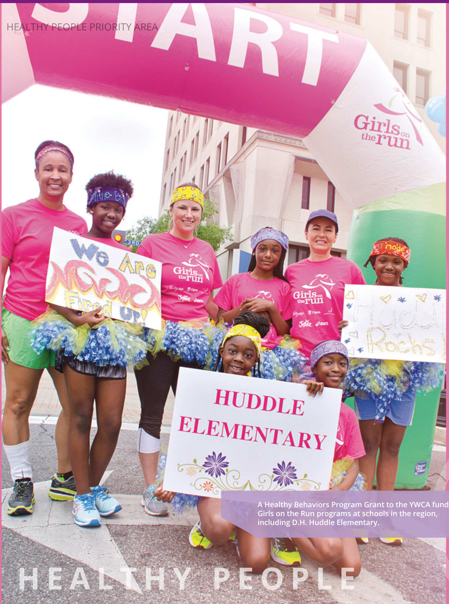
A Healthy Behaviors Program Grant to the YWCA funds Girls on the Run programs at schools in the region, including D.H. Huddle Elementary.