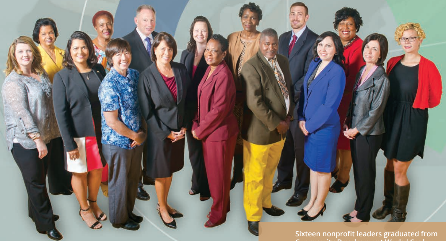
Sixteen nonprofit leaders graduated from Community Development Works' Cenla Boardbuilders program.